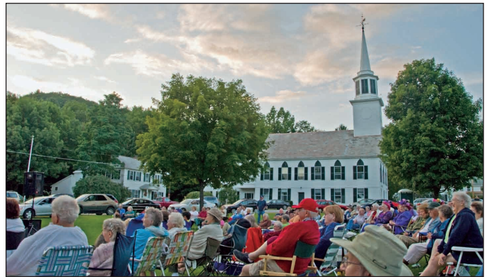
Bring a blanket or lawn chair to the concert, and feel free to come early with a picnic - it’s become a tradition!