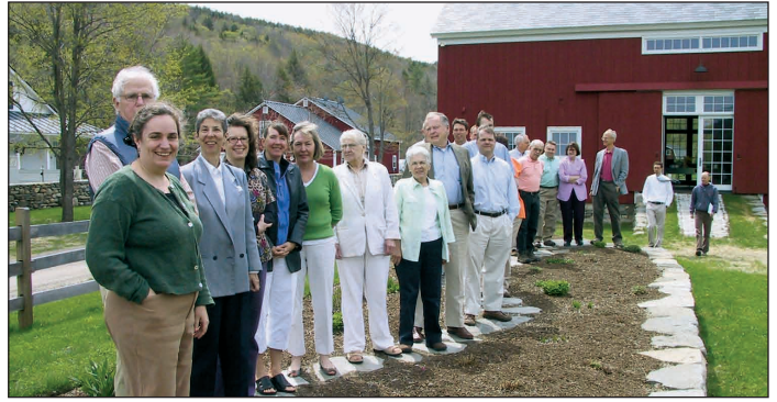
On Saturday, May 2nd, 31 Board members, medical practitioners, and administrative staff met at River Ledge Farm in Grafton, VT, for an all-day Grace Cottage Planning Retreat. The hospital's mission, vision, and critical issues were discussed, with brainstorming sessions held in large and small groups.