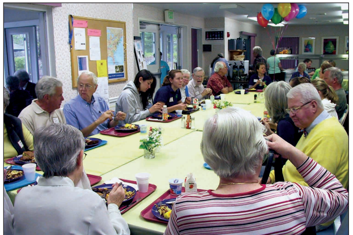
About 80 Grace Cottage Hospital volunteers filled two rooms on Saturday, May 9, as they enjoyed a delicious buffet breakfast prepared by Grace Cottage's dietary staff. If you're a Grace Cottage volunteer and you couldn't make it to this year's event, call (802) 365-9109 to receive a Grace Cottage Hospital umbrella and to put yourself on the mailing list for next year's Volunteer Appreciation Breakfast!