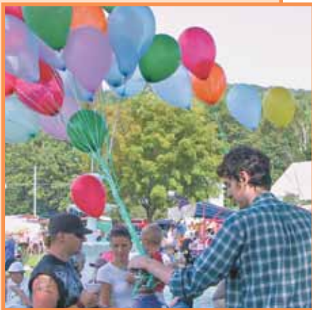
Balloons are a big hit at Fair Day.

JUGGLING BASKETBALLS? Sounds impossible, but a New England Center for Circus Arts performer did it with ease at the 61 st Grace Cottage Hospital Fair Day on August 6 th . Organizing for the Fair is like juggling many balls, but for 11 years I have marveled at how smoothly it is accomplished with our many booth chairs and volunteers. Enthusiasm, dedication, and creativity – all describe the people who make the Fair a success year after year.