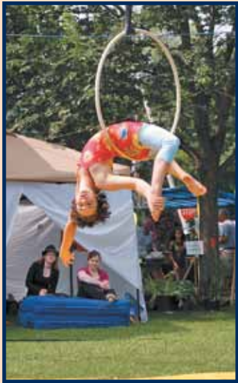
New England Center for Circus Arts performers are always a crowd pleaser.