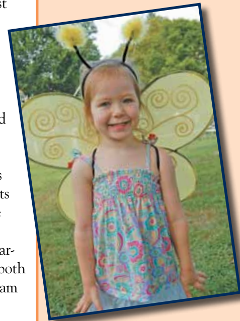
This butterfly looked ready to fly.