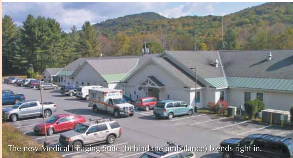
The new Medical Imaging Suite (behind the ambulance) blends right in.