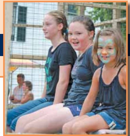
Three Fairgoers in the Dunking Booth were in the water a moment later!

The high bidder who got these signs at the Fair Day Auction may have used them after Hurricane Irene.